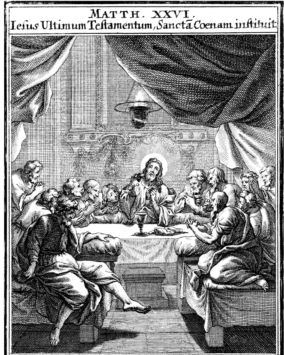
Woodcut illustration from a 1695 Bible – Matthew 26 Jesus initiates the Eucharist at the Last Supper on Maundy Thursday evening.