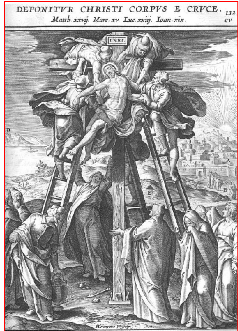
From “Illustrations of Gospel Stories” Jerome Nadal – Matthew 27 The body of Jesus is taken off the Cross after the Crucifixion.