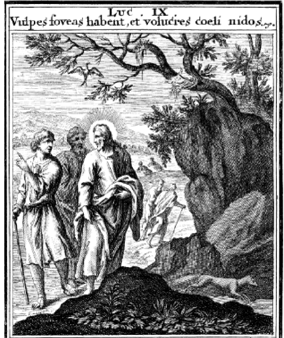
Woodcut illustration from a 1695 Bible – Luke 9 - The Cost of Discipleship. Jesus discusses the cost of discipleship with two individuals. Images of the bird and fox illustrate.