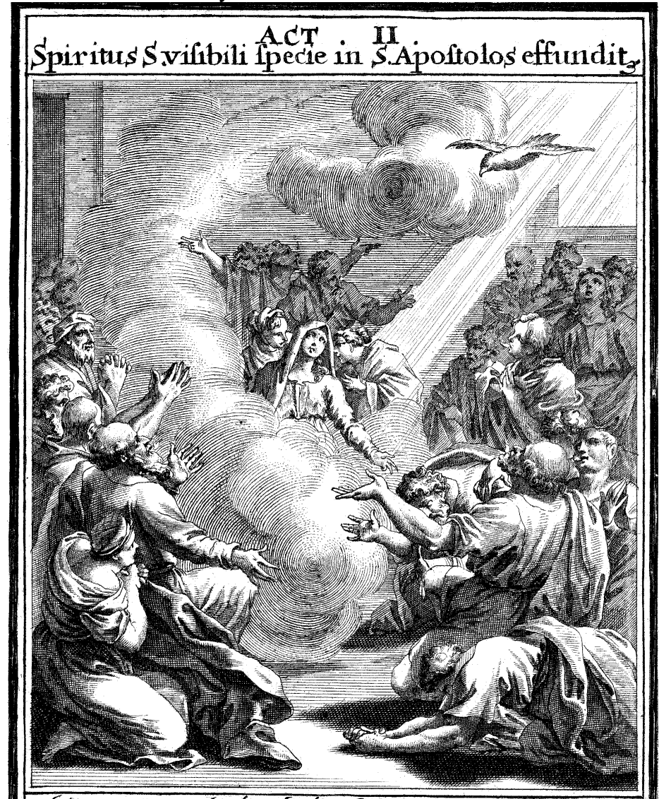
Woodcut illustration from a 1695 Bible – Acts 2

Our Savior Lutheran Church 🏰 Lakeland, FL, USA The Feast of Pentecost 🕊 Coming of the Holy Spirit May 19 th 2013 ✝ 9:30am